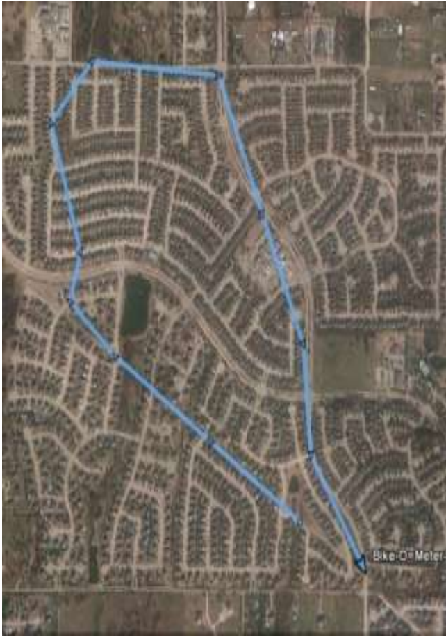
GPX file displayed in Google Earth