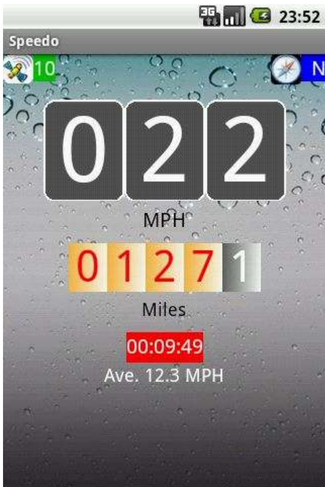
Figure 2 SPEEDO Main Screen

The main screen displays the following information: